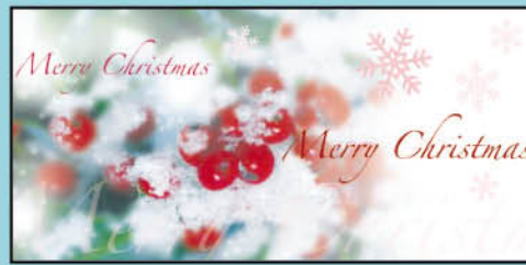
Frosty Berries Size: 100 x 210mm Price per pack: £3.50 Order ref: ELX 11594 H