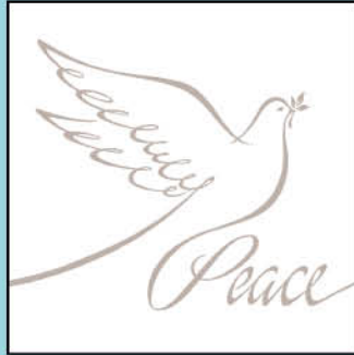
Glitter Dove Size: 125 x 125mm Price per pack: £3.50 Order ref: ELX 9009 B