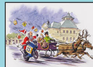
Santa's been caught parking on double-yellow lines Size: 148 x 210mm Price per pack of 10: £5.00 Order ref: 2010-03