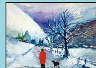
Sulby Glen Size: 148 x 210mm Price per pack of 10: £5.00 Order ref: 2010-04

2012 Calendar 14pages in 4 colour with Isle of Man scenes, with one 'month to a page', spiral bound and supplied with an Envelope for posting. £3.99