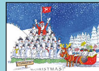
Tynwald Hill Santa Size: 148 x 210mm Price per pack of 10: £5.00 Order ref: 2010-02