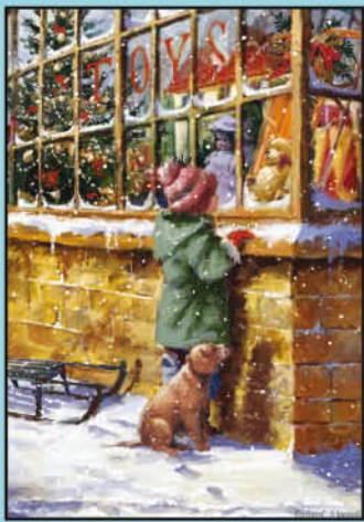
Come with us Size: 145 x 100mm Price per pack: £3.25 Order ref: ELX 7182 A