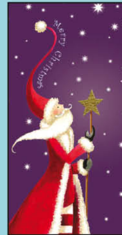
Quirky Santa Size: 171 x 86mm Price per pack: £3.25 Order ref: ELX 11711 H