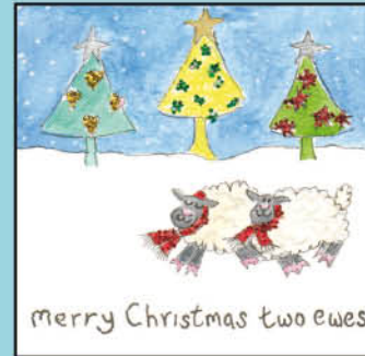
Merry Christmas Two Ewes Size: 125 x 125mm Price per pack: £3.50 Order ref: ELX 11740 B