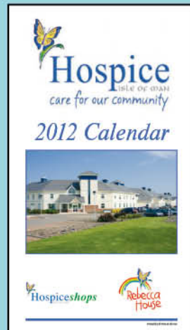
2012 Hospice Calendar Size: 320 x 170mm Price per Calendar: £3.99 Order ref: Calendar (price includes an Envelope)