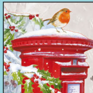
Postbox Robin Size: 150 x 150mm Price per pack: £4.00 Order ref: ELX 1193 C