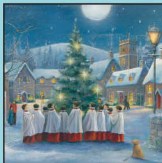
Village Choir Size: 140 x 140mm Price per pack: £4.00 Order ref: MCJX 0017