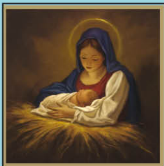
New Born Love Size: 125 x 125mm Price per pack: £3.00 Order ref: ELX 11504 B