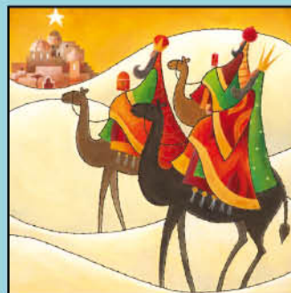
Three Kings Size: 125 x 125mm Price per pack: £3.50 Order ref: ELX 8248 B