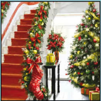
Festive Hallway Size: 125 x 125mm Price per pack: £3.50 Order ref: ELX 11575