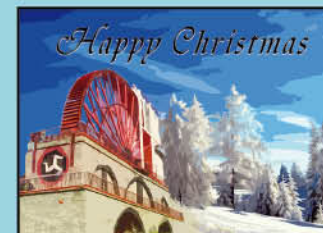
Laxey Wheel Christmas Size: 148 x 210mm Price per pack of 10: £5.00 Order ref: 2010-01

A selection of sixteen Christmas Cards for every taste to view any of the full range of Christmas Cards online, go to the Hospice Shops website: http://www.hospiceshops.com