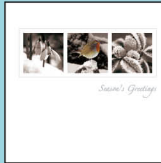
Montage Size: 150 x 150mm Price per pack: £4.00 Order ref: ELX 9382 C